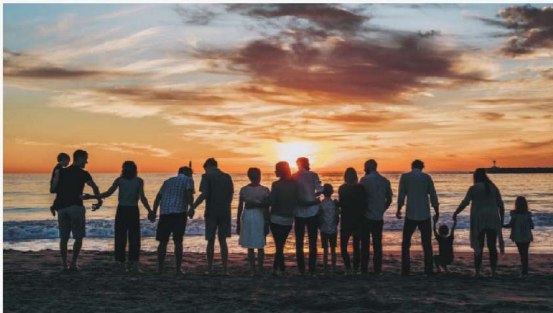
YOUR SURF CLUB