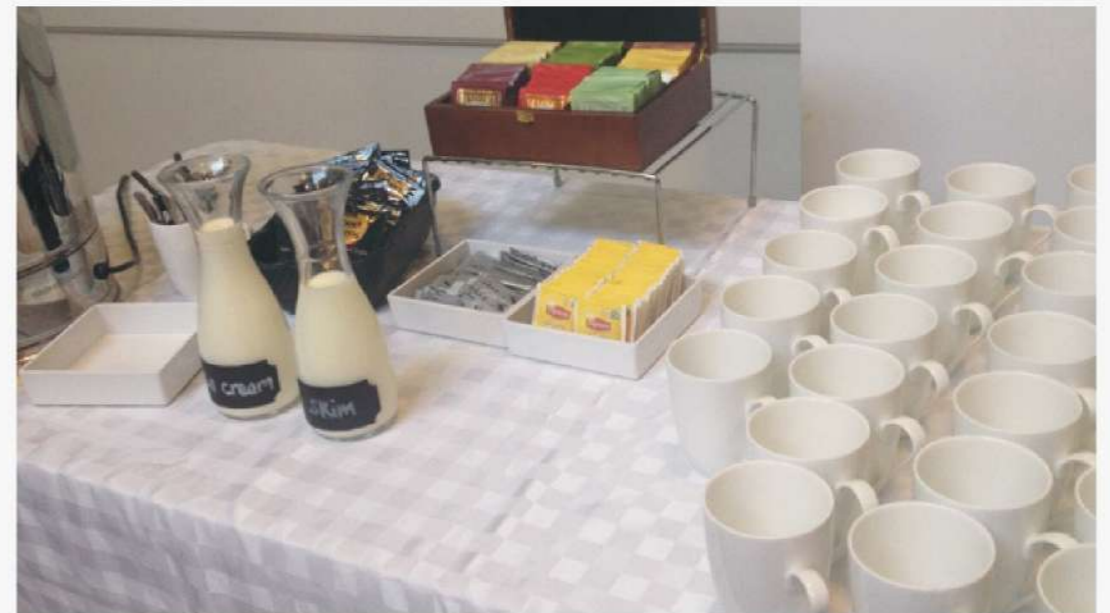
TEA & COFFEE STATION