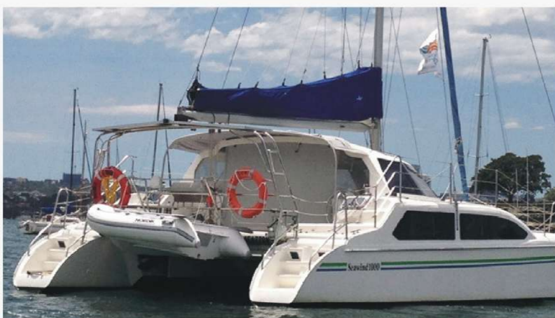
YOUR CATERED DAY ON THE WATER