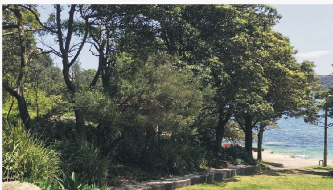
YOUR FAVOURITE BEACH/LOOK OUT