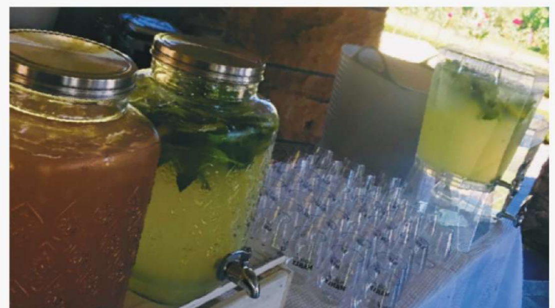
COLD DRINKS DISPENSERS